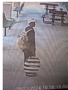
Picture of Suspect